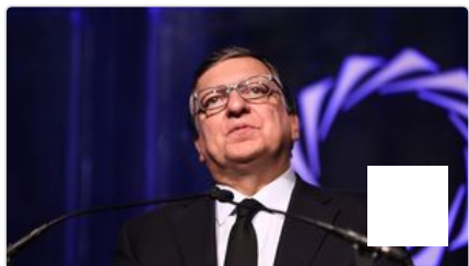
A petition calls for "exemplary measures" against ...